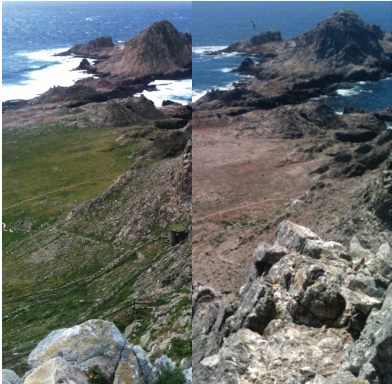
Figure 1. Southeast Farallon Island Fall 2013. Looking out from atop the granite peak of Light House Hill down to the Western Marine Terrace and out to the West Side Hill. The figure shows the drastic change in seasonal vegetation. The left picture was taken February 2013 and the right was taken August 2013.